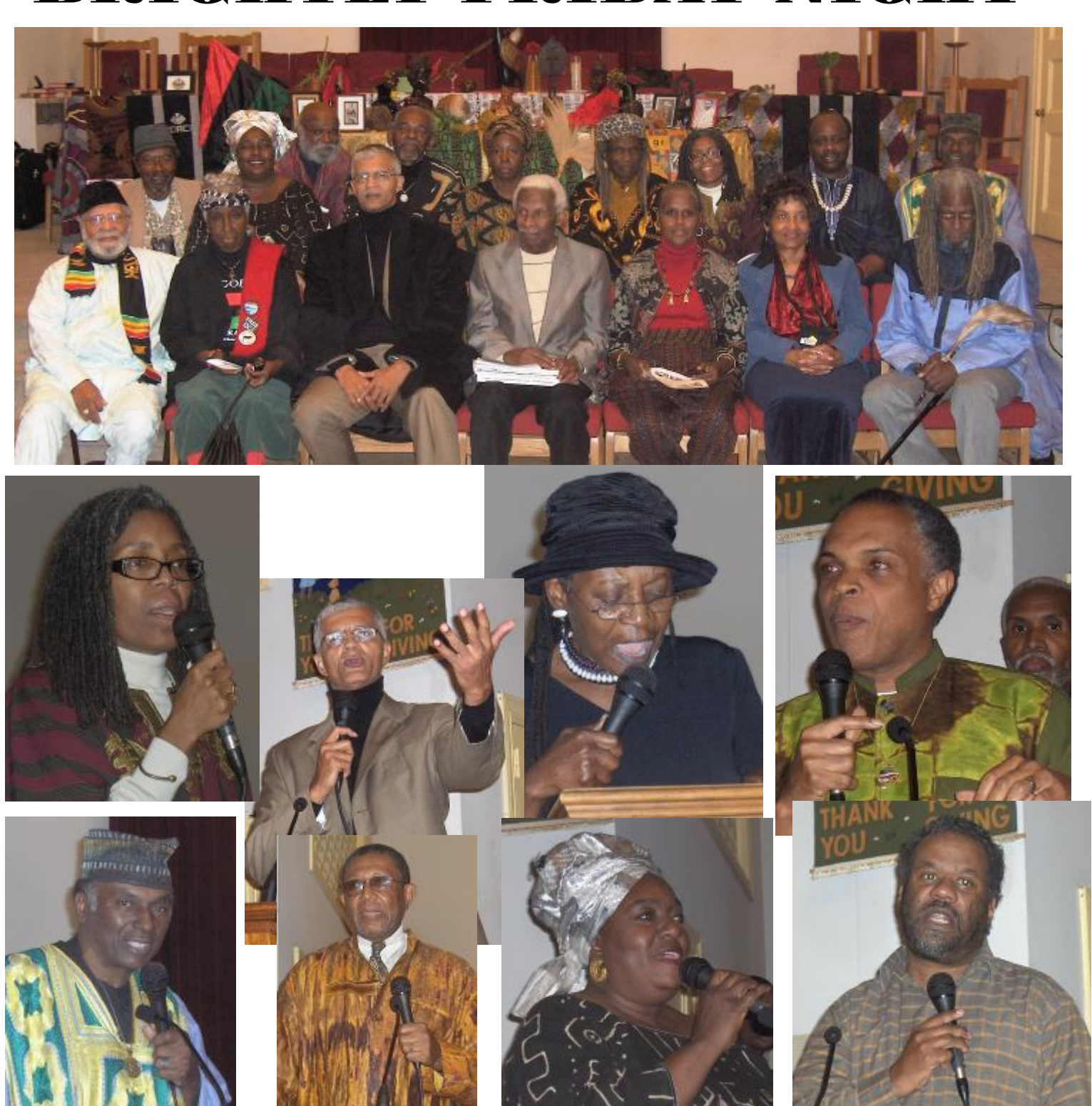
Tomorrow's Stars will shine even brighter!

Join the Reparations Movement & become a Star. Visit www.ncobra.org