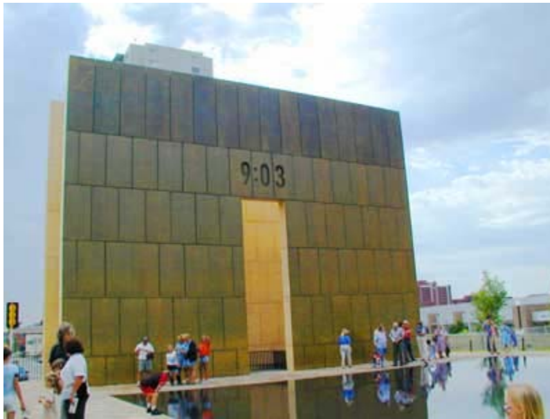
Figure 2 $28 million dollar Oklahoma City Bombing Memorial

In 1998, five years after the horrendous terrorist bombing of the Alfred P. Murrah building in Downtown OKC, which took the lives of 168 innocent victims, the state of Oklahoma rightfully erected the Oklahoma City National Memorial and Memorial Center Museum, a twenty-eight million dollar memorial, to commemorate the victims of that terrible event. 202 No one should ever minimize the loss of lives or the pain and suffering of friends and families of the victims. However, the fact remains that the dreadful Oklahoma City bombing pales in comparison to the horrors of the Greenwood Holocaust in terms of the sheer numbers of lives and property destroyed. Yet, while the Oklahoma City Memorial almost takes up a city block, the current Greenwood Memorial is an appallingly small block of granite. The disparity between the two memorials gives one the impression that the African American lives ruined in the Greenwood Holocaust