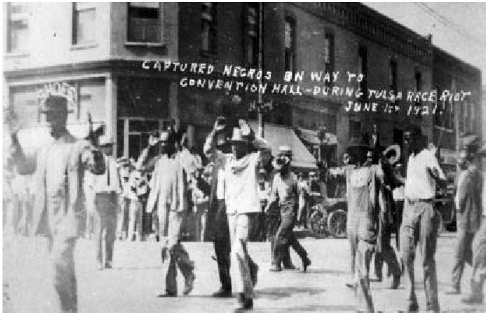
Greenwood Holocaust victims being arrested