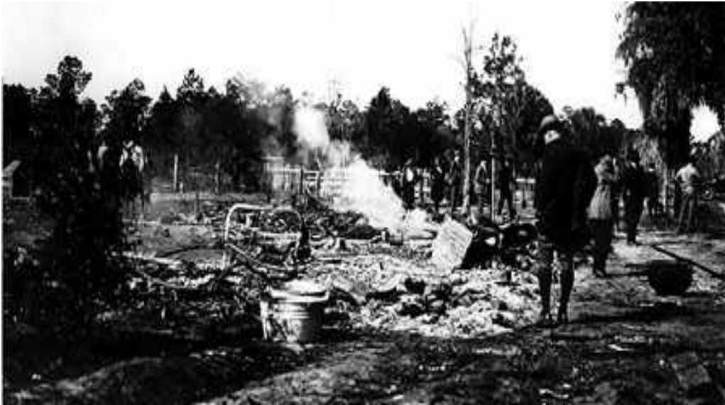
Ruins of a Rosewood house shortly after the Rosewood Massacre