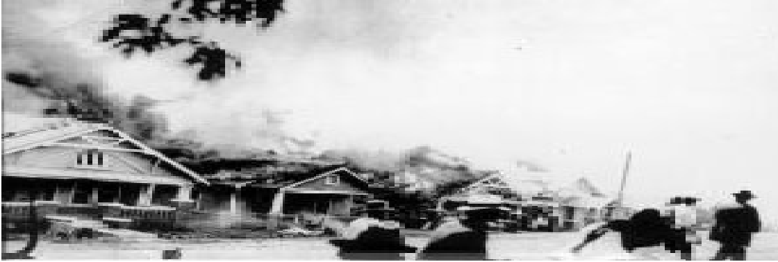
White rioters setting homes on fire

The ruthless mercenaries instituted a scorched earth policy, and virtually burnt every home and business in the Greenwood community. 85 Moreover, the savagery of the thugs equaled some of the most heinous acts of barbarism known to man. For example, many surrendering Greenwood residents were shot and thrown into burning structures. 86 As one contemporary account chronicled, "in times of war, when an allied soldier dropped his weapons and raised his hands as a sign of surrender, the 'barbarous' Germans spared his life. In Tulsa, Oklahoma, however, defenseless men, women and children were murdered without a chance for their lives." 87 Another account argues "civilization broke down in Tulsa...things happened that were on footing with what the Germans did in Belgium, what the Turks did in Armenia, [and] what the Bolsheviks did in Russia." 88 Maybe the most outstanding personal account comes from long-time NAACP official ironically named Walter White, who while on assignment investigated an earlier lynching in Oklahoma, passed for White and was sworn in as one of the emergency deputies. White writes: