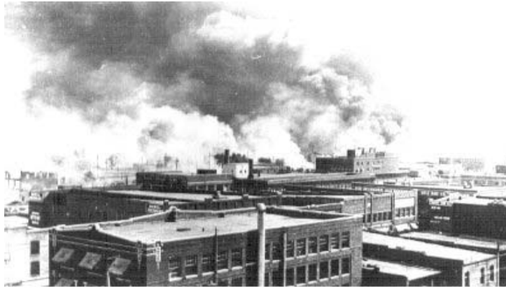
Figure 1 Greenwood burning after the May 31/June 1st terrorist attacks

Greenwood must receive the same type of “New York Liberty Zone” incentives to attract and encourage large and small businesses, to train and hire Greenwood residents. Because of the “gangrene” like effect from eighty-two years of wanton neglect by those responsible for redressing the Greenwood Holocaust, there must be additional incentives to accomplish the goal of putting the community back to where it was before being destroyed; such as: