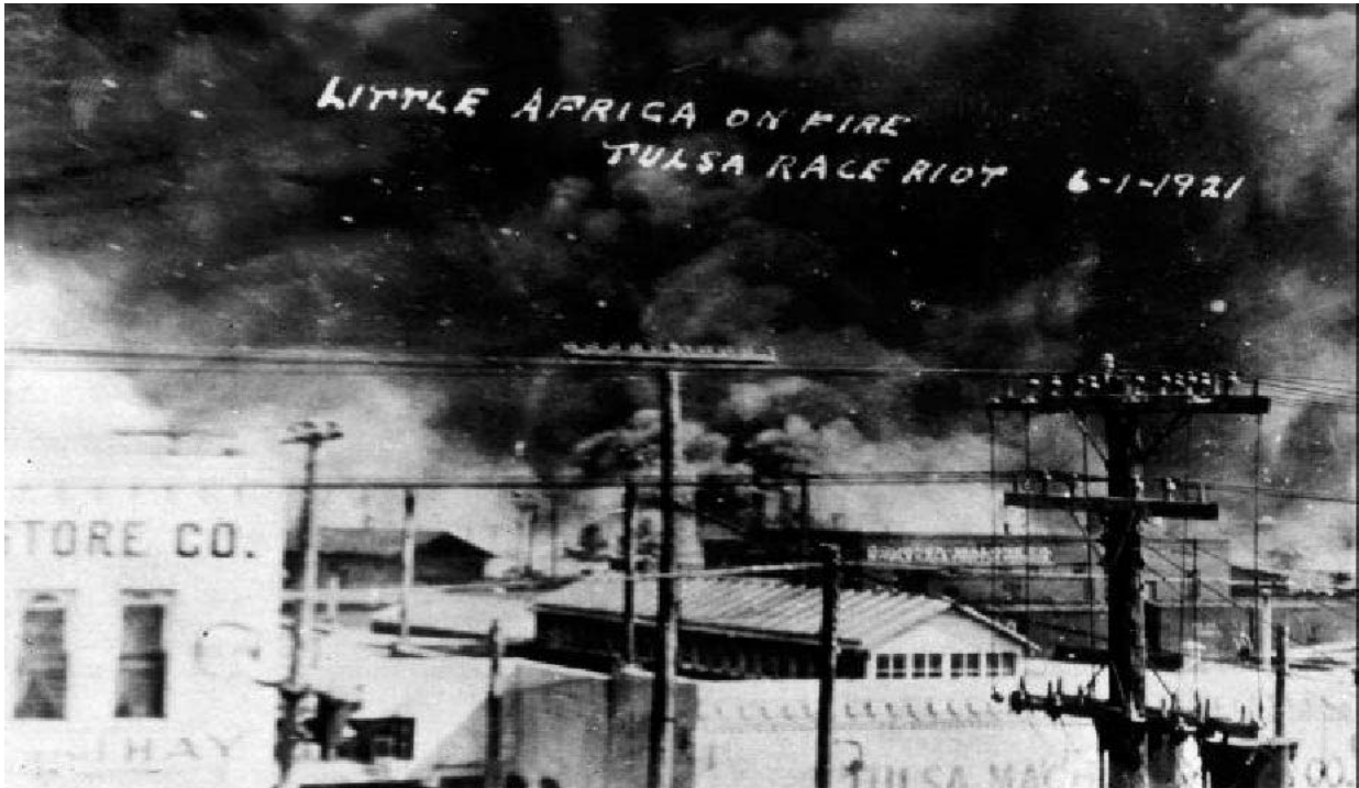
Hell on Earth...Greenwood burns

adequate and comprehensive reparations would settle the matter. 128