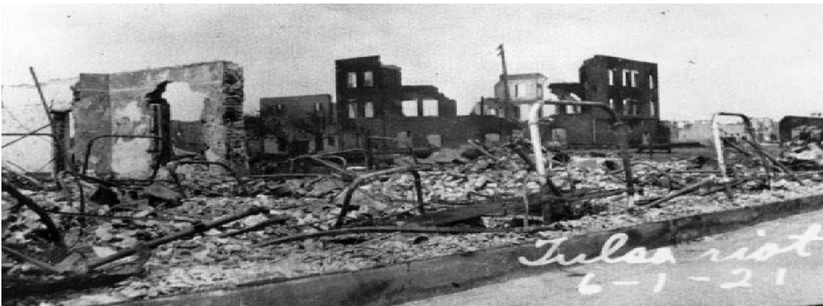
Ruins of a Greenwood neighborhood shortly after the Greenwood Holocaust