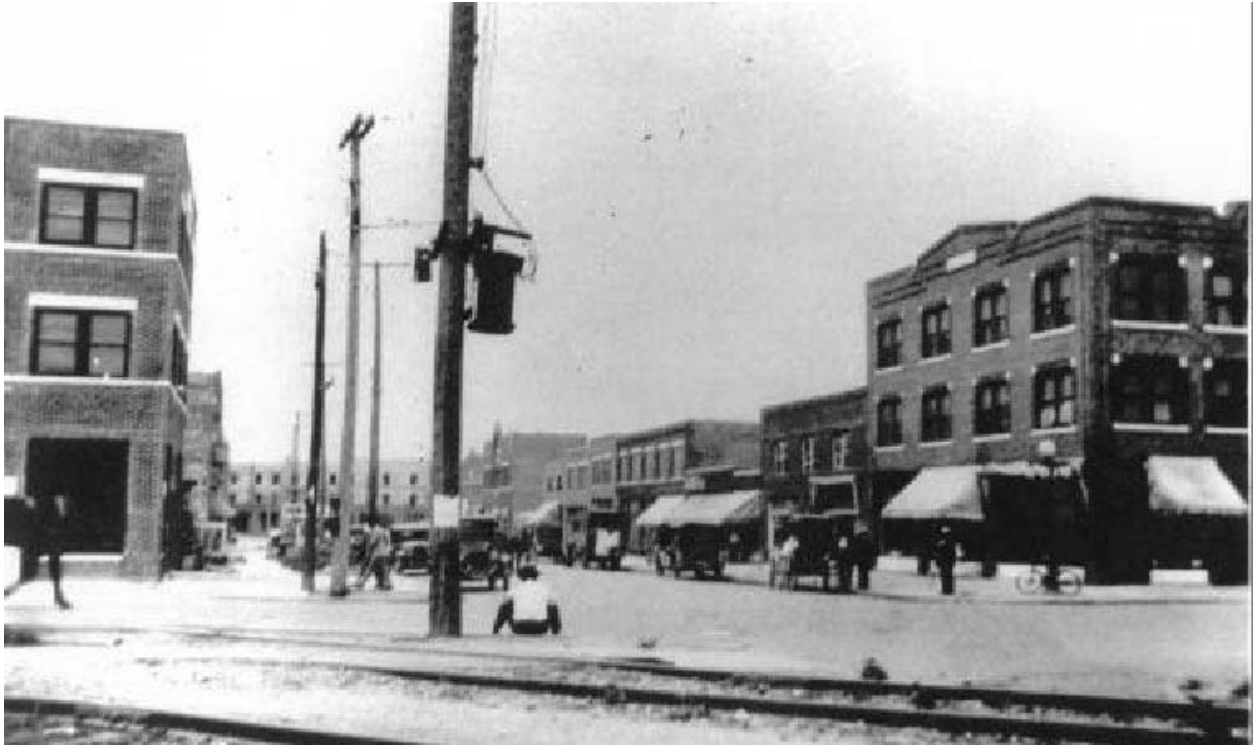
Greenwood District prior to the riot