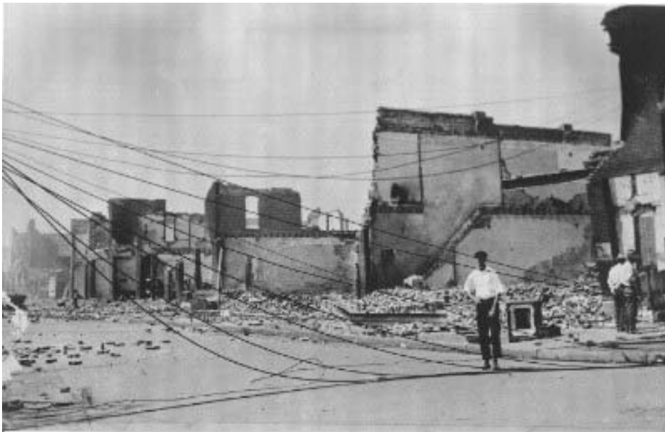
Black Wall Street utterly destroyed!