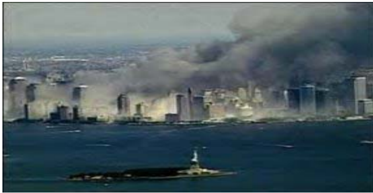
New York burning after the September 11, 2001 terrorist attacks

Policy and lawmakers wanting to re-vitalize the area destroyed in the September, 11, 2001 attacks clearly understood that special provisions would have to be put in place to again attract businesses to that once bustling area. Therefore, congress passed The Job Creation and Worker Assistance Act of 2002 . 198 “The act contains various tax incentives designed to stimulate the economy and aid recovery from the impact of the September 11, 2001 terrorist